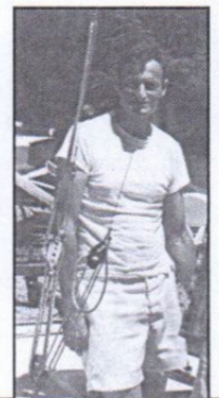
1946 Yearbook photos