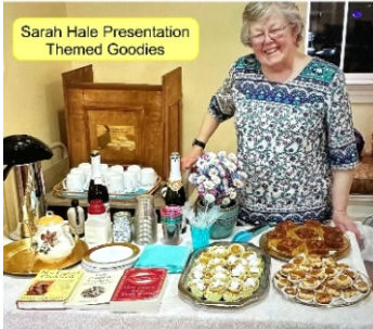
Sarah Hale Presentation Themed Goodies