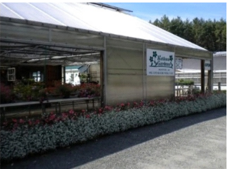
Kathan Gardens located on Elm St.