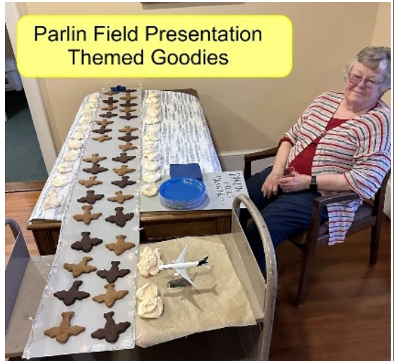
Parlin Field Presentation Themed Goodies