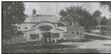
One of Van's Pine Tree Products buildings on Spring St. in Newport.