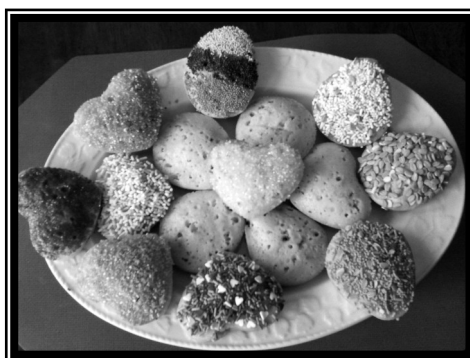
Decorated or plain, they are tasty!

Butter or spray your individual cups and place on a cookie sheet with a lip. Preheat oven to 350°. Cream the butter with a mixer, add sugar and beat together. Add eggs and flavoring and beat very well. Add flour and mix gently until combined. Add currants, if using. Fill molds to one half to two-thirds full (a quarter-cup scoop is wonderful here.) Sprinkle tops with sugar, or wait until baked to decorate.