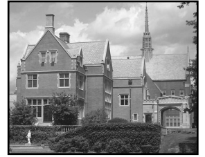
Towle's house in Newton, MA

If your kids want to add chocolate chips, you'd have Toll House-Towle House pancakes!